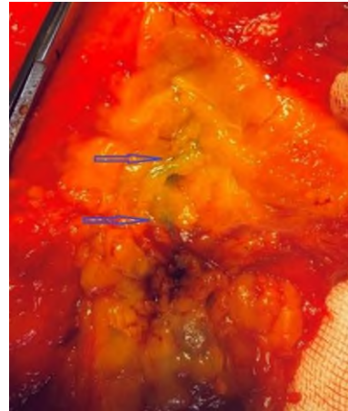
Fig. 2. Lymph nodes are stained with Patent Blue dye.