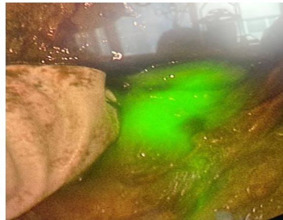
Fig. 4. Sentinel lymph node stained with ICG dye 15 minutes after injection.

After dissecting stained lymph nodes, a pathohistological examination was performed during the operation. In addition, sentinel lymph nodes were also examined with the help of immunohistochemical analysis if a metastatic lesion was suspected. In the absence of signs of metastatic cells in the lymph nodes, only two sentinel lymph nodes were dissected, and axillary lymph node dissection was not performed. The advantages of this technology include the simplicity of this method and the absence of radiation exposure.